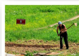
NATIONAL CAPACITIES AND RESIDUAL CONTAMINATION CROATIA